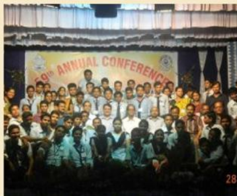
Student Volunteers at 59th Annual Conference of ACTA