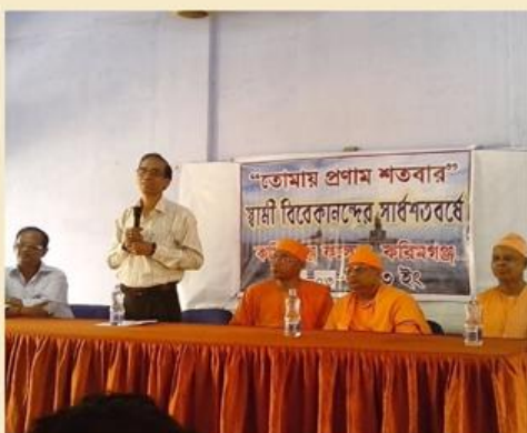
Guest Lecture on 150 th Birth Anniversary of Sami Vivekananda