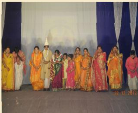
Cultural function of Annual Fest-2013