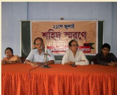
Celebrating Language Martyrs Day