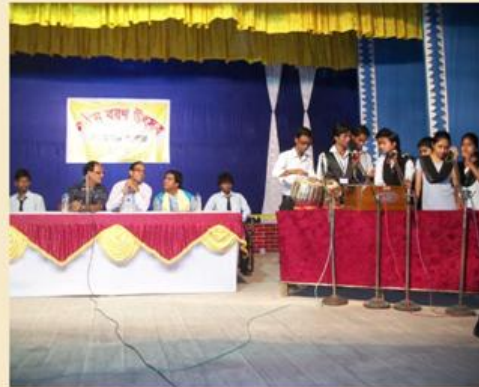
Students performing during Fresher's Welcome-2013