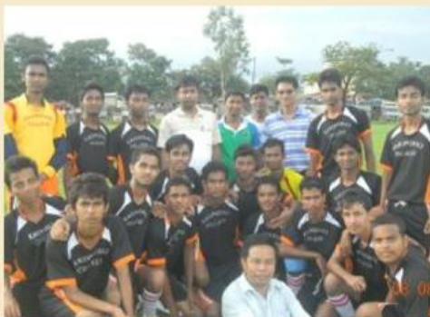
Football Team of Karimganj College