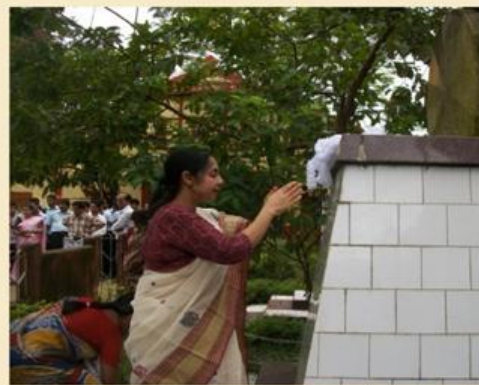
Shradhanjali to Language Martyrs Tomb at Karimganj College on 21 st July