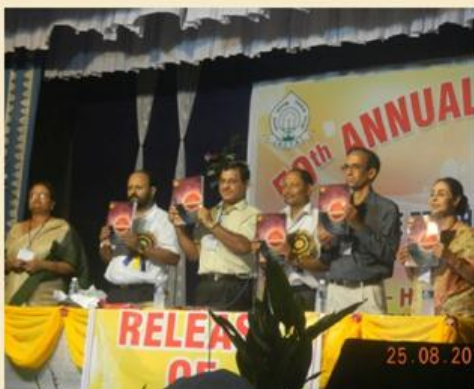
Release of Souvenir at 59th Annual Conference of ACTA