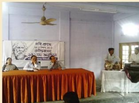
Observing Birth Anniversary of Kabiguru Rabindranath Tagore