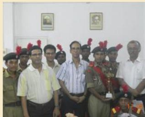
Principal with former & current CTO and NCC cadets